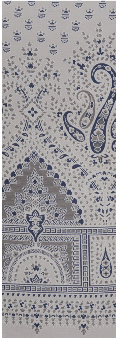
STORM Composition 66% silk/34% linen Ref F2523P/AN0682.2