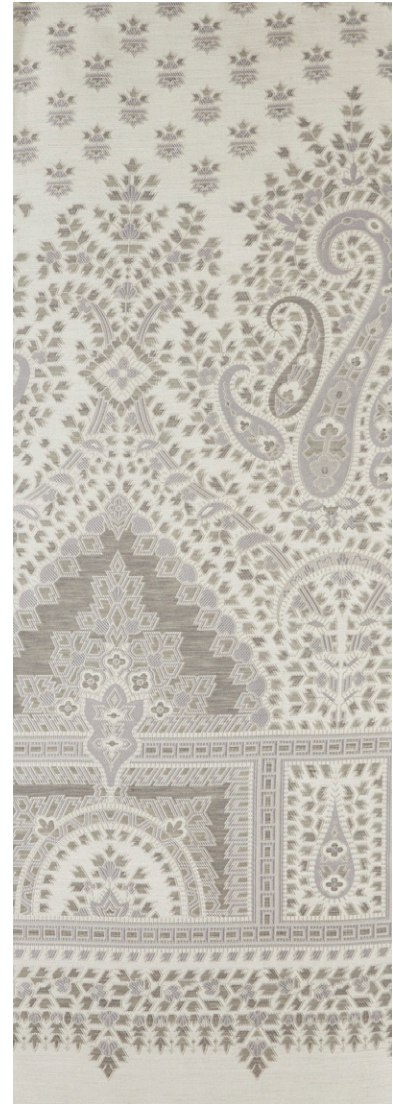
RHODIUM Composition 66% silk/34% linen Ref F2532P/AN3113.2