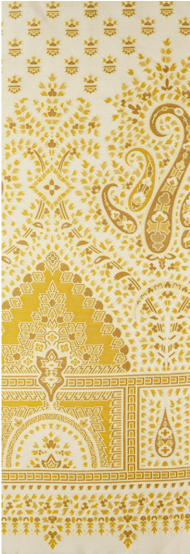
DAFFODIL Composition 100% silk Ref F2523P/AR4790.2