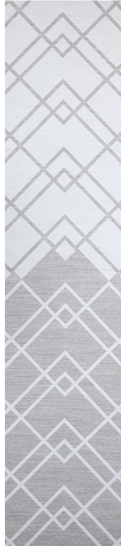
IMPERIAL Composition 83% wool/17% silk Ref F2652/AU3283.2