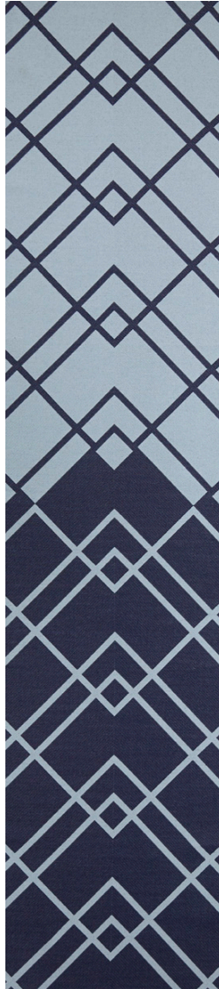
DANUBE Composition 83% wool/17% silk Ref F2652/AU3283.1