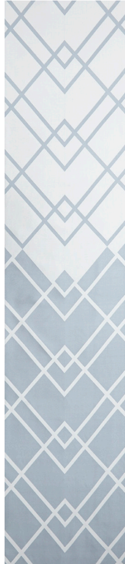
LAGOON Composition 100% silk Ref F2652/AU3284.1