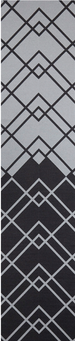
ANTHRACITE Composition 83% wool/17% silk Ref F2652/AU3283.3