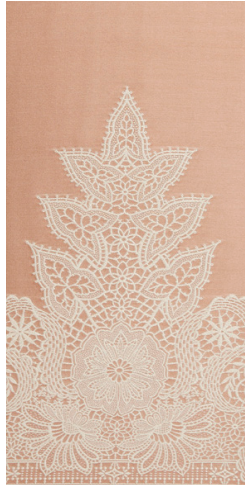
SATEEN Composition 72% cotton/28% silk Ref F2460/AU4762.3