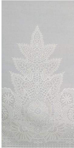
IMPERIAL Composition 72% cotton/28% silk Ref F2460/AR4313