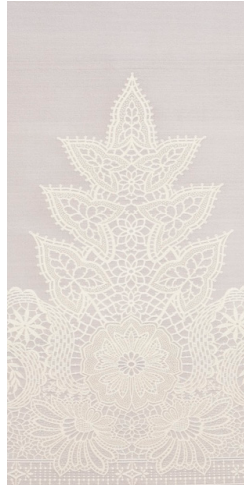
BREEZE Composition 72% cotton/28% silk Ref F2460A/AN2041.2