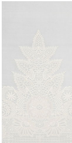
PORCELAIN Composition 72% cotton/28% silk Ref F2460A/AN2041.1