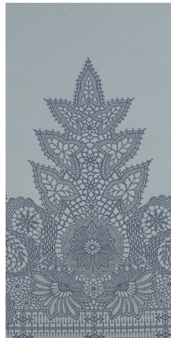
DUSK Composition 72% cotton/28% silk Ref F2460A/AN2041.3