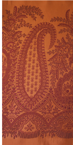
AUTUMN Composition 100% silk Ref F2137/AL4110.6