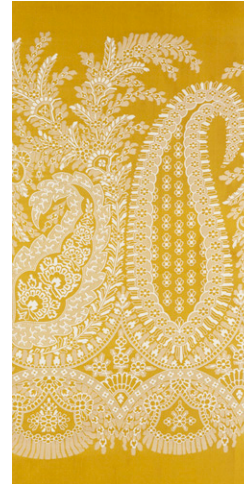
OLD GOLD Composition 100% silk Ref F2137/AL4111.1