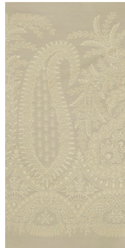
PLATINUM Composition 17% silk/ 83% wool Ref F2396/AM1004/002