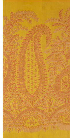
LIQUID GOLD Composition 100% silk Ref F2137/AL4110.2