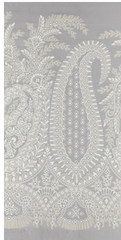
SLICK Composition 100% silk Ref F2497/AR7398/001