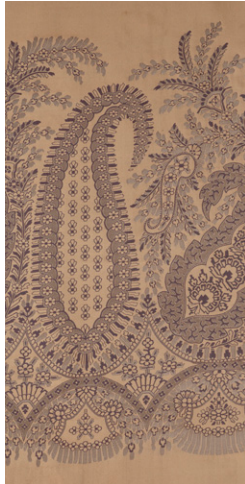
MUSK Composition 100% silk Ref F2137/AL4111.2