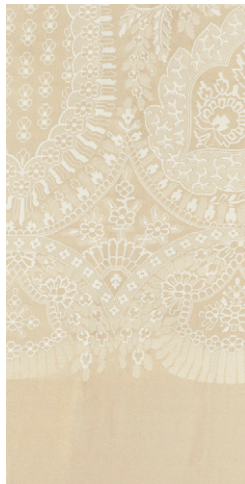
OAT Composition 100% silk Ref F2137/AJ3091