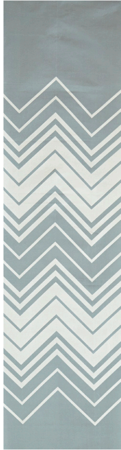
SMOKY BLUE Composition 100% silk Ref F2533/AR4257