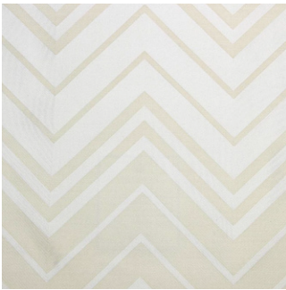
PEARL Composition 100% silk Ref V92807/AH0342.1