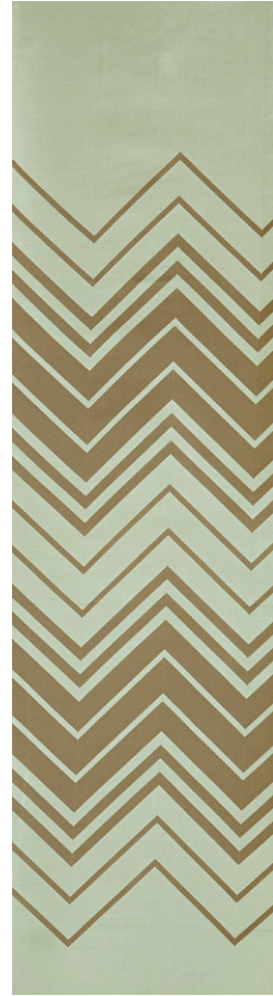
EAU DE NIL Composition 100% silk Ref F2533/AR4246