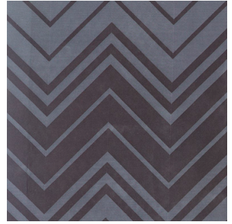
SLATE Composition 100% silk Ref V92807/AH0344.1