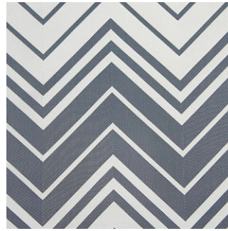
INK Composition 100% silk Ref V92807/AH0342.2