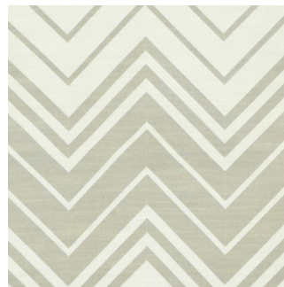
PLATINUM Composition 83% wool/17% silk Ref VA0458M/AP2535.8