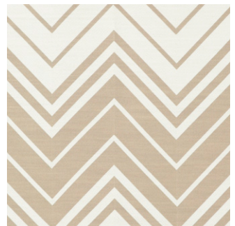
BUFF Composition 83% wool/17% silk Ref VA0458M/AP2535.9