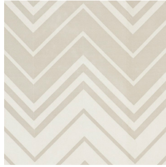
SILVER Composition 100% silk Ref V92807/AR0276.4