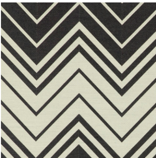
MONOCHROME Composition 83% wool/17% silk Ref VA0458M/AP2535.1