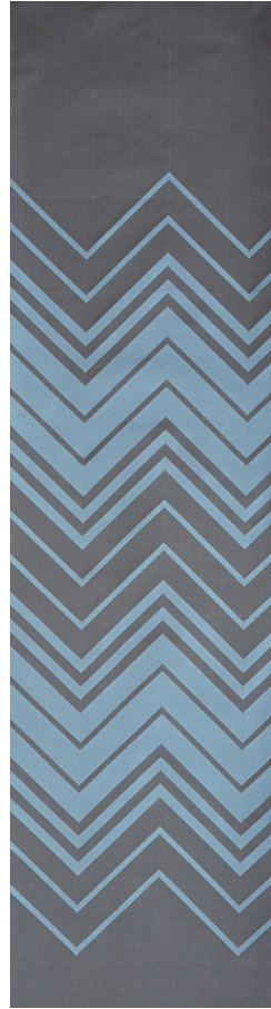
AMERICANA Composition 100% silk Ref F2533P/AP9718