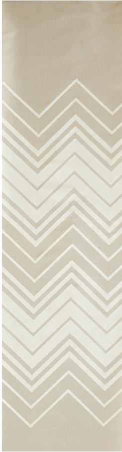
IMPERIAL Composition 100% silk Ref F2533/AR5375