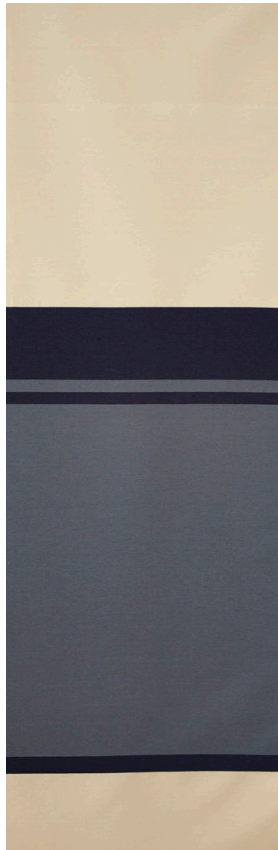
AMERICANA Composition 80% wool/ 20% silk Ref F2508/AR4310