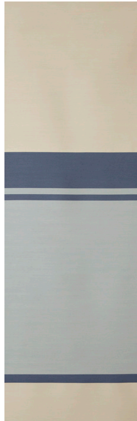
MARINE Composition 80% wool/ 20% silk Ref F2508/AM9268.1