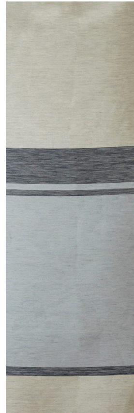
NAUTICA Composition 52% linen/ 48% silk Ref F2554/AN2886.1